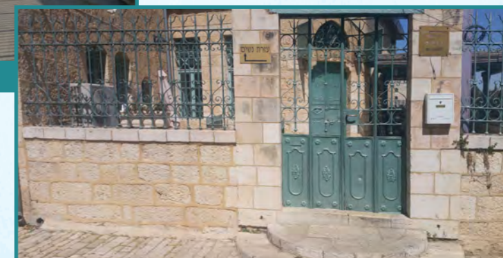
The Yemin Moshe Synagogue